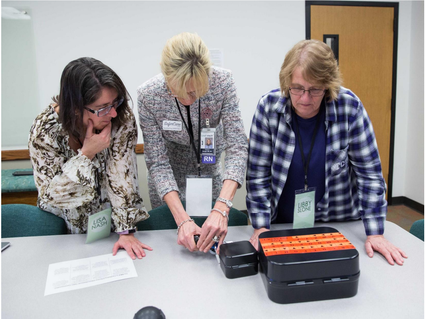
(Photo credit: Jill Johnson. Faculty apply teamwork strategies to play the IP Escape room game.)

Therefore, it is imperative faculty are equipped to provide interprofessional education in the classroom and authentic examples of interprofessional practice in clinical settings. To be effective faculty must develop the appropriate knowledge, attitudes and skills associated with core competencies around the values and ethics, roles and responsibilities, communication and teamwork needed for successful interprofessional collaboration. Development of Innovative strategies to overcome professional silos and barriers to effective interprofessional teamwork will help faculty more fully engage learners and integrate IPE into their courses.