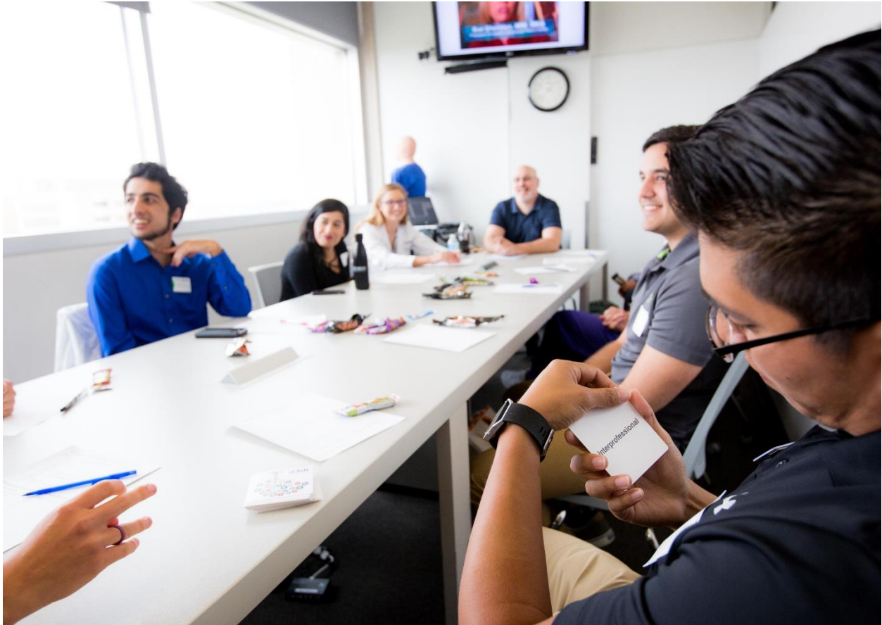
(Photo credit: Jill Johnson. Interprofessional class of students play word game in teams.)