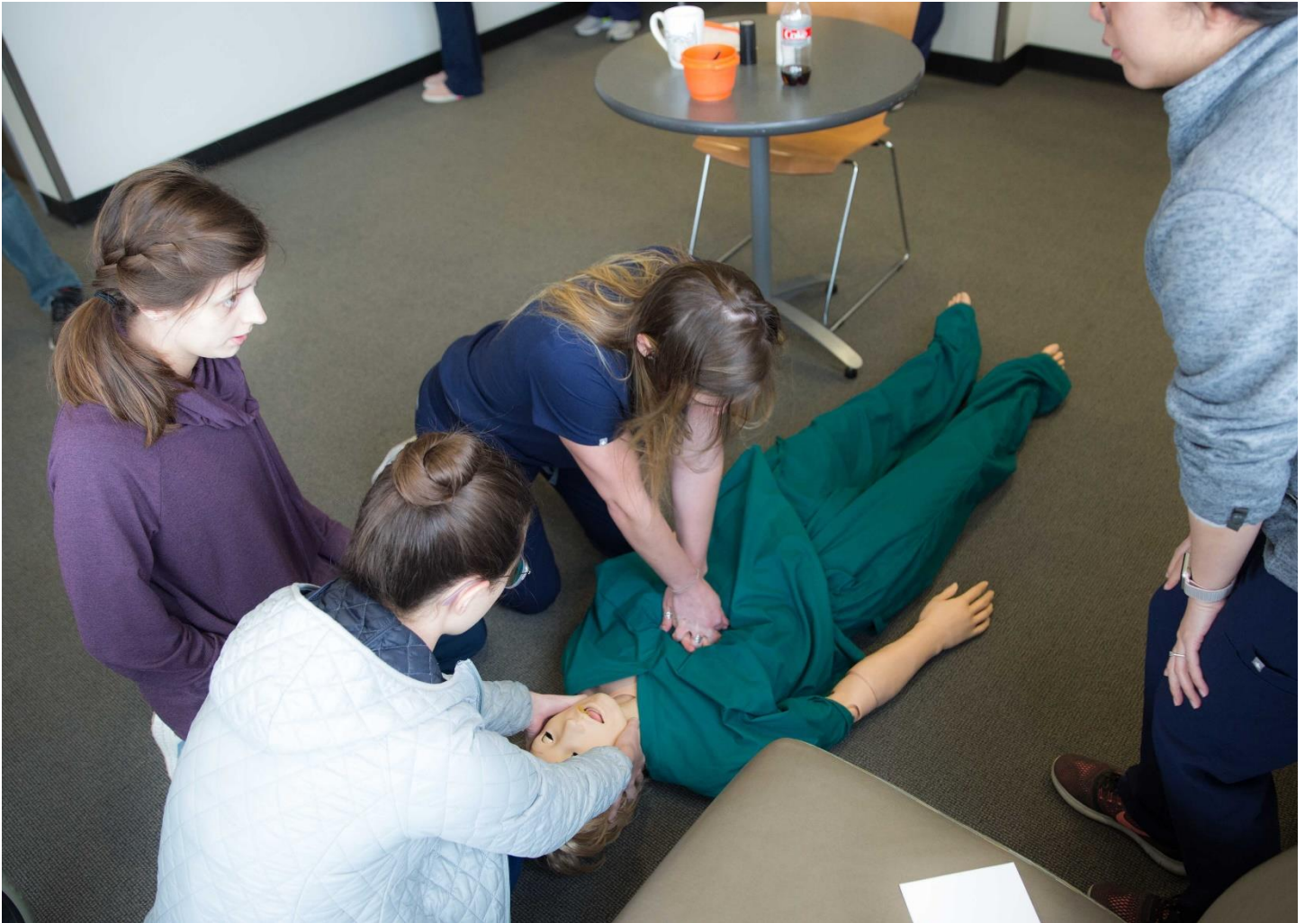
(Students apply strategies and tools to improve team performance in simulation.)