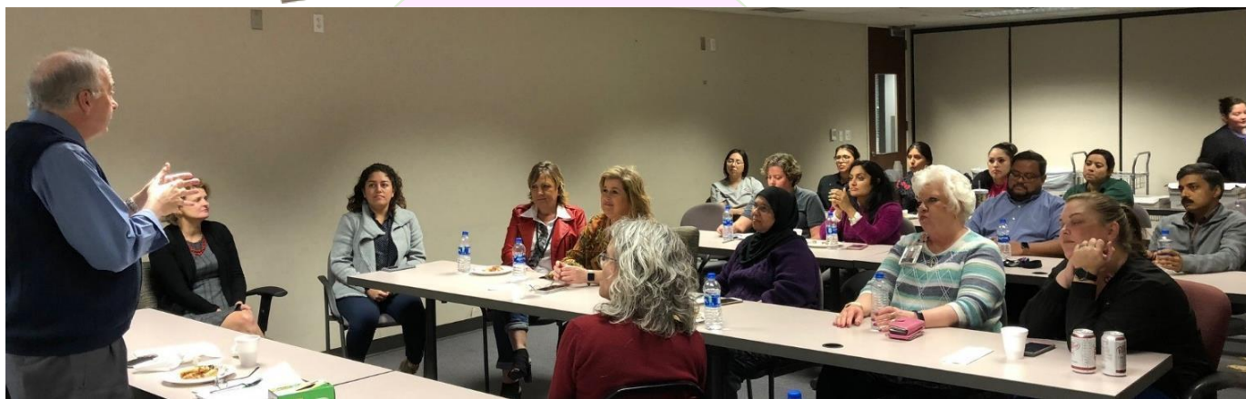
Departmental meeting to discuss on Employees Engagement